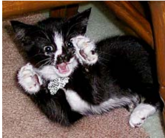
A tin foil ball is a safe, easy, inexpensive toy that your kitten will love.

Some pet products should not be used for babies. Collars and harnesses can get tangled around him if adjusted too loose. If too tight, they soon constrict painfully since babies grow rapidly. Strays have come to shelters with collars embedded in their necks. Clumping clay litter is not for kittens. It clogs their insides if swallowed. Pellets of newspaper or sawdust are the best litter for babies.