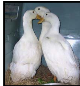
Larry, Curly and Moe were fugitives from a packing plant who found refuge at Katie's Place before being sent to a good home.