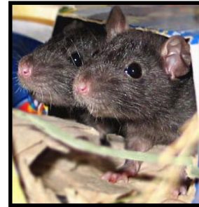
Ratkin and Ratlet came to us from the local SPCA shelter when they had an explosion in their pocket pet population.

Yes. When nobody else can take them, we try to make room for any helpless, hopeless animal that we can fit in. Our animals have included cats, rabbits, guinea pigs, rats, two sheep, two budgies, chickens, ducks, a turtle, a quail, a pigeon and a mouse. (We can't take dogs unless we can find foster homes for them since bylaws require acreage.) Although our focus is cats we are in truth a multi-species shelter.