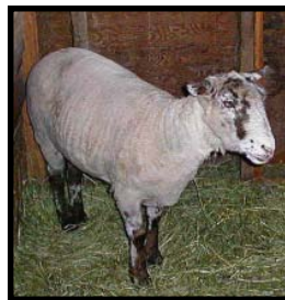
Ewenice was fished out of the Fraser River and we had her shorn of 60 lbs of wool - two years' growth.

Mail: Can be sent to us c/o 10255 Jackson Road Maple Ridge, BC, V2W 1G5