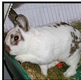
Roger was an SPCA bunny that they turned over to us. He settled in at Katie's Place and made friends among the other bunnies until he was adopted into his own home.